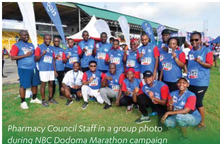
Pharmacy Council Staff in a group photo during NBC Dodoma Marathon campaign