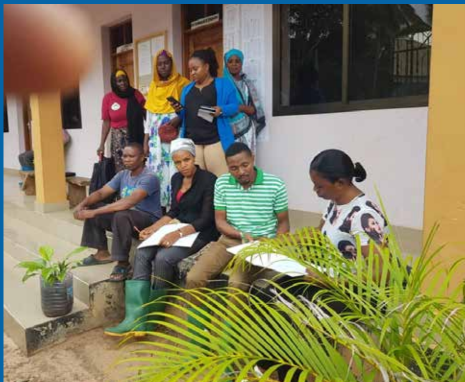
Physical supervision to observe the progress after training

is a place where patients seek immediate health solutions before visiting a health facility where a more advanced care is provided. The project is pivoted in those three pillars.