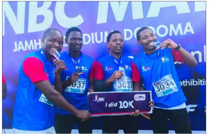
I did 10km to Support Cervical Cancer Awareness

About 6695 women in Tanzania die each year from cervical cancer because of the advanced stages at diagnosis and lack of effective treatment